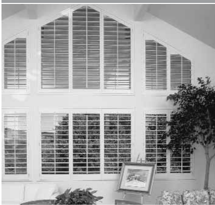
The Finest in Custom Wood or Poly Shutters

Any way you look at it, your windows will be beautiful with our custom designed shutters, shades and draperies.